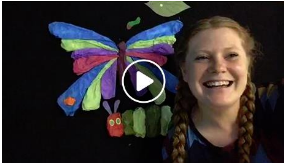
Story Time Snippet- The Very Hungry Caterpillar

August holds even more opportunities for creatively bringing literature, literacy, and learning to our community!